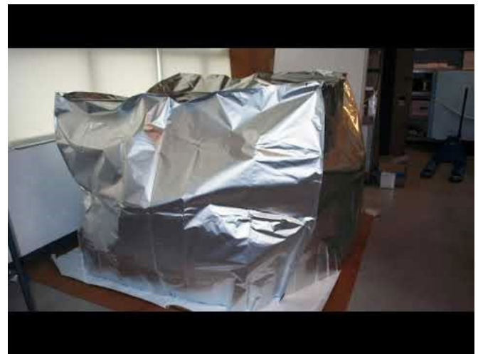
AnoxiBug: How it works

Click here to watch a video of an AnoxiBug treatment: https://www.youtube.com/watch?v=Nw96bDRsH0g