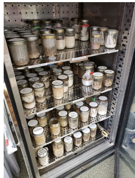
Insects Limited's environmental chamber for rearing museum and stored product insects.

cast skins are great indicators of existing populations of the destructive beetles.