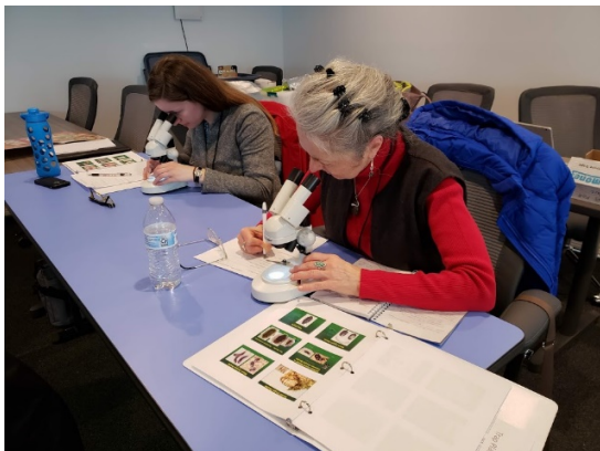
IPM in Museums and Historic Homes attendees identifying museum insects.

Wood boring insects like the Powderpost Beetle ( Lyctus spp ), Furniture Beetle ( Anobium punctatum ), and Old House Borer ( Hylotrupes bajulus ) can bore in wood objects and cause extensive damage including structural damage. The larvae can spend months or years inside wood while developing and feeding on the starch content. Wood boring insects emerge from wood as adults, leaving behind pinhole-sized openings called shot holes. Shot holes and powdery frass below these holes are indications of wood boring insect damage.