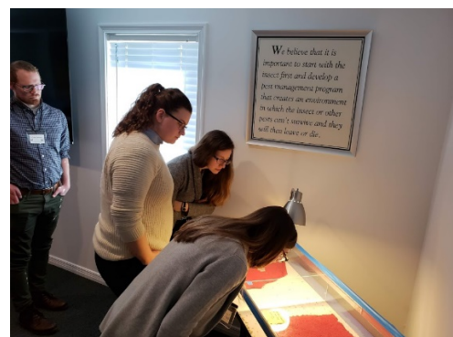
IPM in Museums and Historic Homes attendees looking at Webbing Clothes Moth ( Tineola bisselliella ) damage to a wool sweater.

Moths like the Webbing Clothes Moth ( Tineola bisselliella ) and Case-making Clothes Moth ( Tinea pellionella ) larvae feed on textiles and natural fibers.