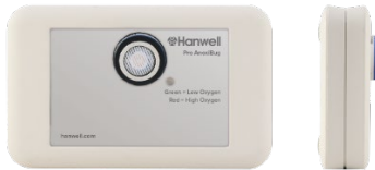
AnoxiBug Oxygen Monitor