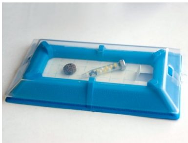
All Beetle Trap with a dermestid lure and AA Carpet Beetle Pheromone

insects. Dermestid beetles can be best monitored by a food lure and pheromone lure in a floor trap. Moths like the Webbing Clothes Moth and Case-Making Clothes Moth can be monitored using hanging or floor traps containing a pheromone lure.