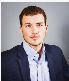
Quinn Kelley Insects Limited

Pest issues can sometimes cause interesting scenarios. Often our customers will perform their own identification of what pest insect that they think that they have and then order a set of pheromone traps and lures from us.