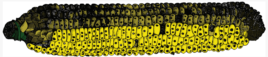
Angoumois grain moths had infested this Flint corn causing the holes in each kernel (left)