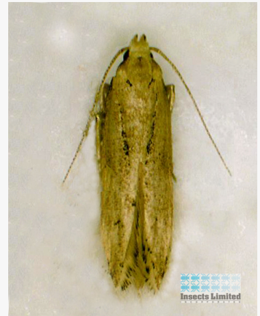
The webbing clothes moth on the left and the Angoumois grain moth on the right are both light-colored moths that are similar in size, yet their diets are very different. This example shows the value in a correct identification.