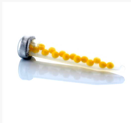
Here we have our Rice Weevil Bullet Lure (IL-703) . We know it's the Rice Weevil lure because of the yellow balls inside.

Aggregation pheromones are released by males and attract both male and female insects. The insects are tricked into thinking they are meeting with other members of their species which draws them in.